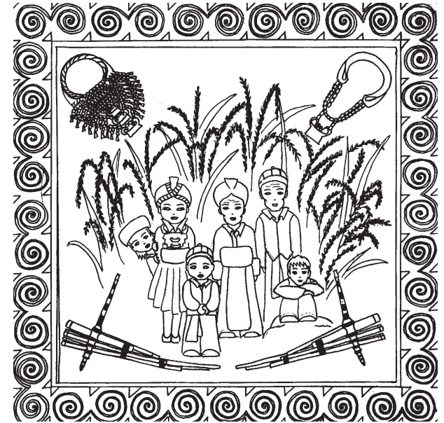
Katrina L. Vue